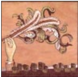
ARCADE FIRE Funeral Merge (29555)