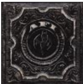
AFI AFI Nitro (15859)