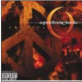
A PERFECT CIRCLE eMOTiVe Virgin (66687)