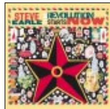
STEVE EARLE The Revolution Starts... Now (Artemis)