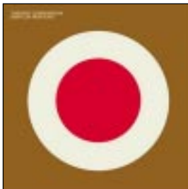
THEIVERY CORPORATION Babylon Rewound ESL (078)