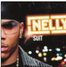
NELLY Suit Universal (331601)