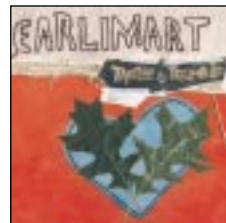
EARLIMART Treble And Tremble (Palm)