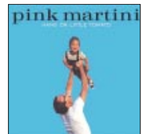
PINK MARTINI Hang On Little Tomato Heinz (2)