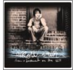
ELLIOTT SMITH From A Basement On The Hill Anti (86741)