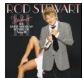
ROD STEWART Stardust: The Great American Songbook Vol. III J (62812)