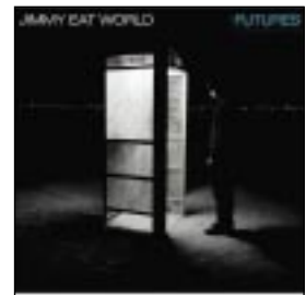
JIMMY EAT WORLD Futures Interscope (003358)