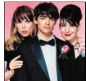
LE TIGRE This Island Strummer-Universal (338502)