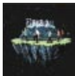
Ima Robot No. 4 Debut