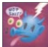
Quasi No. 2 Debut