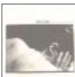
Iron And Wine No. 1 Debut